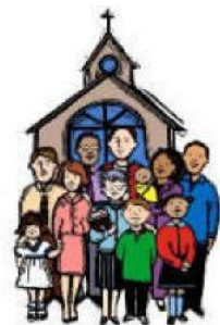
New Member Class