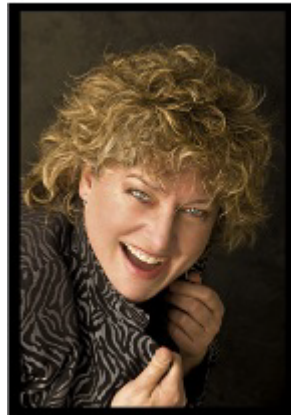
simply extraordinary music